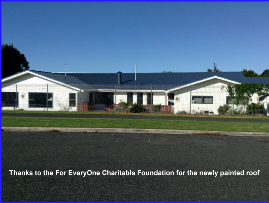
Thanks to the For EveryOne Charitable Foundation for the newly painted roof