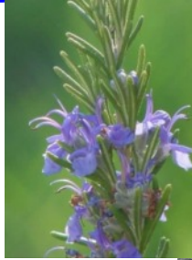
Rosemary for remembrance

www.facebook.com/Forget-Me-Not-Whangarei