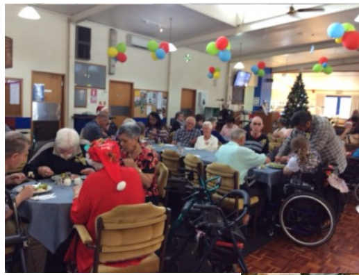
Christmas party photos