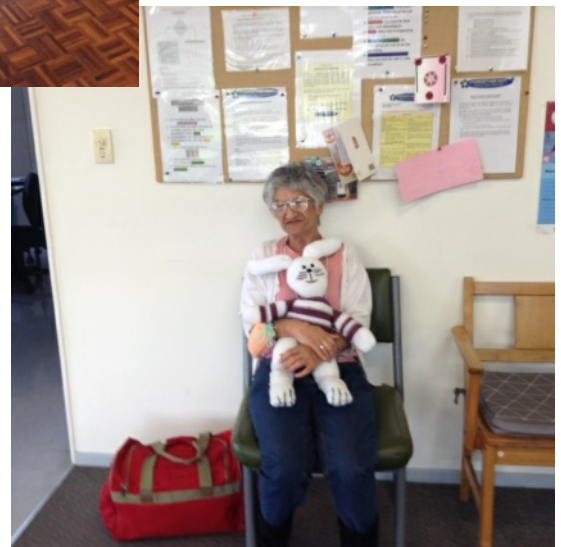
Trip to Tamaterau